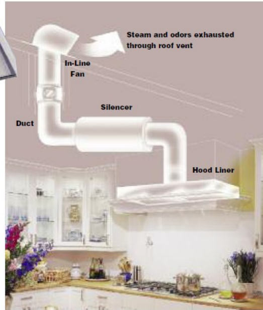
When installing the Fantech Custom Range Hood Liner, the typical application will include the liner, a duct silencer and a remote mounted fan.

NOTE: Call for replacement filters if needed.